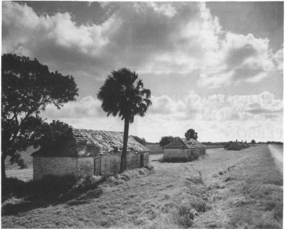
Criterion A - The Old Brulay Plantation, Brownsville vicinity, Cameron county, Texas. Historically significant for its association with the development of agriculture in southeast Texas, this complex of 10 brick buildings was constructed by George N. Brulay, a French immigrant who introduced commercial sugar production and irrigation to the Rio Grande Valley. (Photo by Texas Historical Commission).