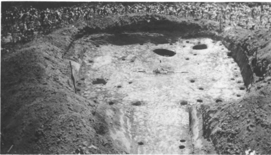
Criterion D - Champe-Fremont 1 Archeological Site, Omaha vicinity, Douglas County, Nebraska. This archeological site, dating from ca. 1100-1450 A.D., consists of pit houses and storage pits which have the potential to yield important information concerning the subsistence patterns, religious and mortuary practices, and social organization of the prehistoric residents of eastern Nebraska.