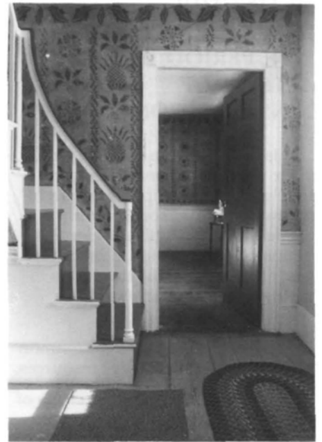
Grant Family House, Saco vicinity, York County, Maine. Properties possessing high artistic value meet Criterion C through the expression of aesthetic ideals or preferences. The Grant Family House, a modest Federal style residence, is significant for its remarkably well-preserved stenciled wall decorative treatment in the entry hall and parlor. Painted by an unknown artist ca. 1825, this is a fine example of 19th century New England regional artistic expression. (Photo by Kirk F. Mohney).

defined within the context of Criterion C. Districts, however, can be considered for eligibility under all the Criteria, individually or in any combination, as is appropriate. For this reason, the full discussion of districts is contained in Part IV: How to Define Categories of Historic Properties . Throughout the bulletin, however, districts are mentioned within the context of a specific subject, such as an individual Criterion.