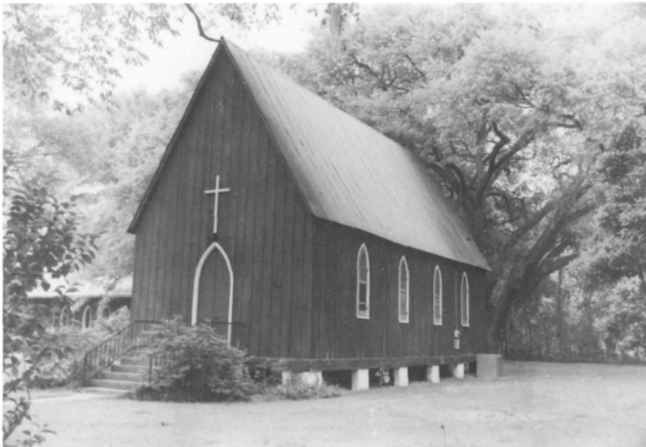
Criteria Consideration A - Religious Properties. A religious property can qualify as an exception to the Criteria if it is architecturally significant. The Church of the Navity in Rosedale, Iberville Parish, Louisiana, qualified as a rare example in the State of a 19th century small frame Gothic Revival style chapel. (Robert Obier)