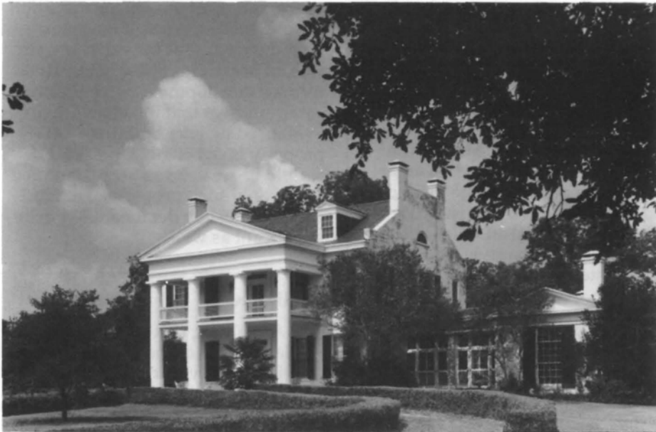
Richland Plantation, East Feliciana Parish, Louisiana. Properties can qualify under Criterion C as examples of high style architecture. Built in the 1830s, Richland is a fine example of a Federal style residence with a Greek Revival style portico.

Properties may be eligible for the National Register if they embody the distinctive characteristics of a type, period, or method of construction, or that represent the work of a master, or that possess high artistic values, or that represent a significant and distinguishable entity whose components may lack individual distinction.