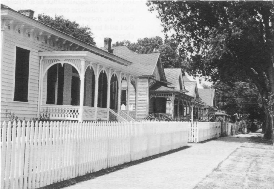
Ordeman-Shaw Historic District, Montgomery, Montgomery County, Alabama. Historic districts derive their identity from the interrelationship of their resources. Part of the defining characteristics of this 19th century residential district in Montgomery, Alabama, is found in the rhythmic pattern of the rows of decorative porches. (Frank L. Thiermonge, III)

business districts canal systems groups of habitation sites college campuses estates and farms with large acreage/ numerous properties industrial complexes irrigation systems residential areas rural villages transportation networks rural historic districts