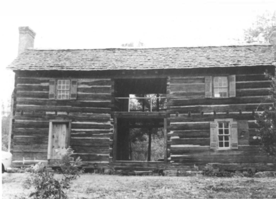
Looney House , Asheville vicinity, St. Clair County, Alabama. Examples of vernacular styles of architecture can qualify under Criterion C. Built ca. 1818, the Looney House is significant as possibly the State's oldest extant two-story dogtrot type of dwelling. The defining open center passage of the dogtrot was a regional building response to the southern climate.